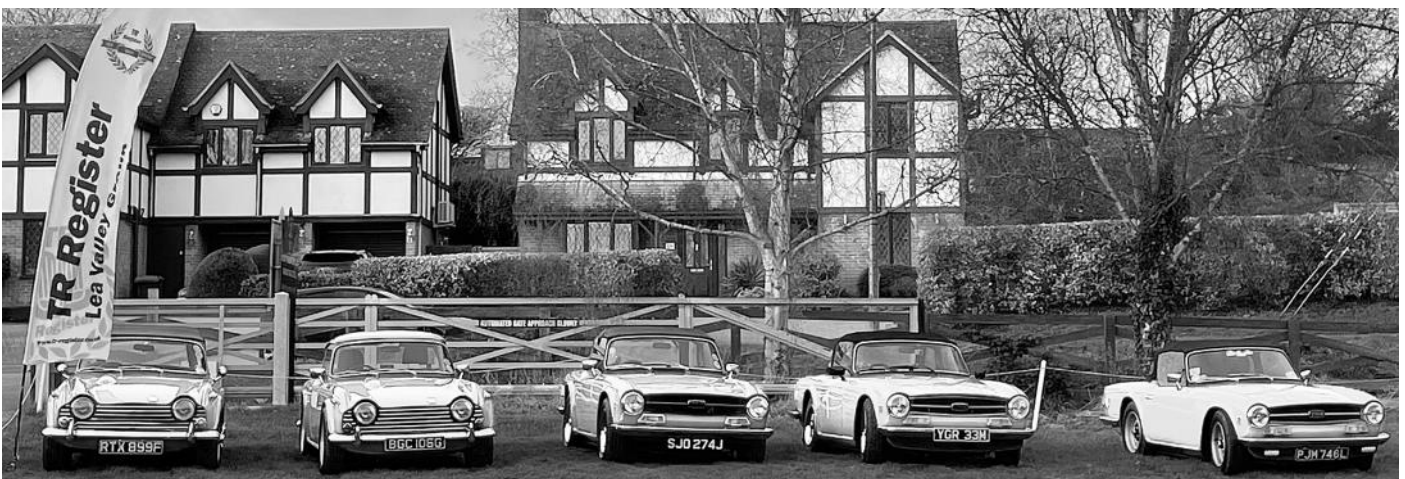
TRs at the AMM/KO lunch .....imagine the colour you wish, not necessarily red !