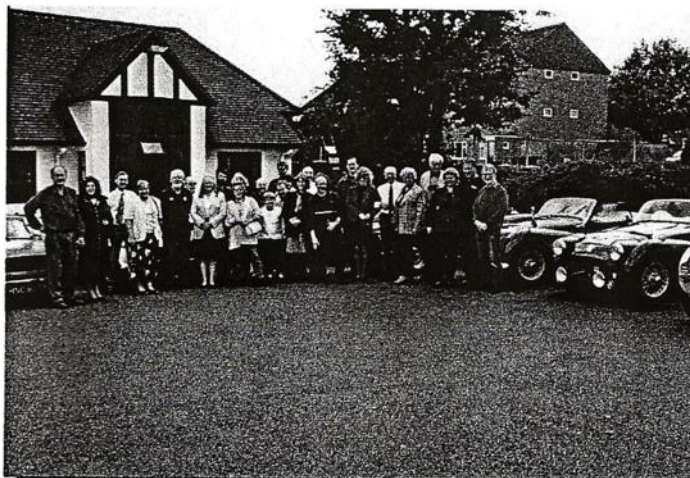
LVG 25 th Anniversary Meeting at Knebworth