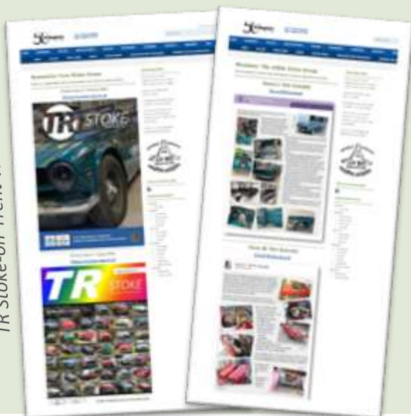
TR Stoke-on-Trent Web site

Our TR Stoke page has had a little facelift, with some photos being added and a couple of new 'tabs' added at the top of the site (Newsletters from Stoke Group & Members TR within Stoke Group). I have added these Newsletters to the site, and member's activity, so you can go and read through them at anytime you want to, and to preserve the history of the Group activities. Its quite amazing reading through the Newsletters, as to what the group has achieved and also the amount of vehicles the group has managed to preserve and get back onto the road. To get to the site search google for TR Stoke-on-Trent or use this Url link: https://www.tr-register.co.uk/group/stoke-on-trent