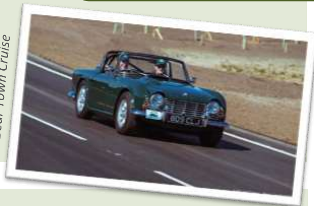
Bear Town Cruise

Congleton New Bypass opens, with a charity event organised by the Bear Town Road Cruise. The event raised over £1800 for Christie NHS Trust, seeing a range of classic cars and commercial vehicles ride the tarmac before it had been officially opened to the public. A couple of TR member got there TR's out to join in the glorious spring day's event.