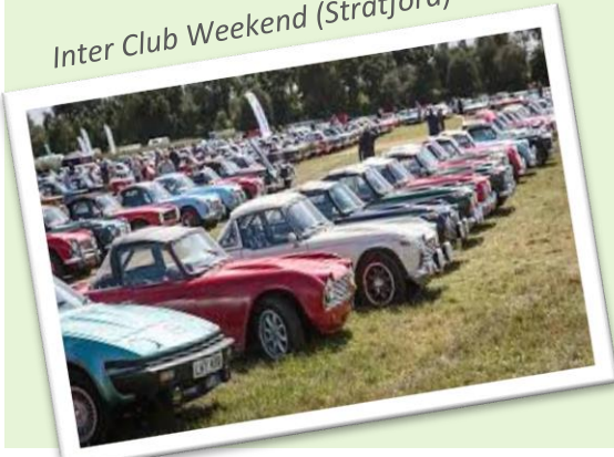
Inter Club Weekend (Stratford)