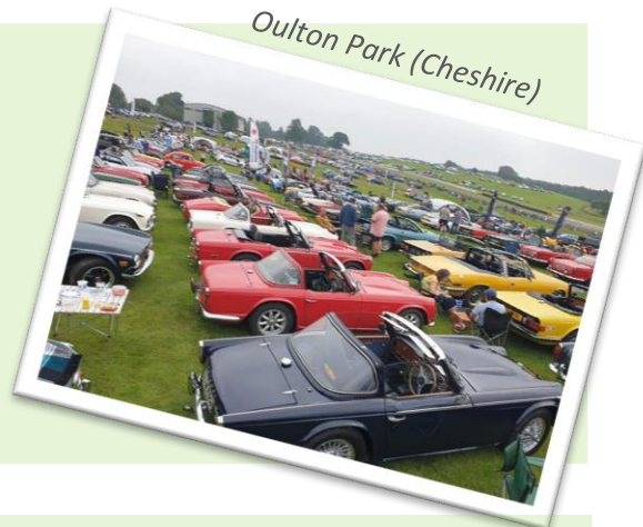
Oulton Park (Cheshire)

August bank holiday weekend saw over 50 TRs attend the Oulton Park Gold cup. The event had Historic formula juniors, historic formula ford, super touring cars, Historic roads sports, XL Aurora trophy, off track entertainment with historic rallying and plenty of classic car displays. A fun event with loads to do and see, great access to the paddocks to soak up the sounds, smells and noise of a real race track in action.