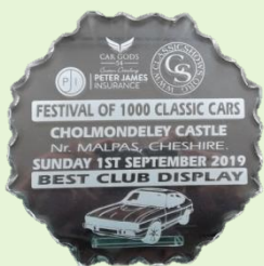
Best Club Display

September saw the Group attend the Cholmondeley Festival of 1000 Classics at the wonderful Cholmondeley Castle. Although the weather was damp the day was well attended by the group. We also were joined by the Shropshire group and in all some 25 cars attended. The day saw the Club stand get best display and the group received a rather nice glass plaque.