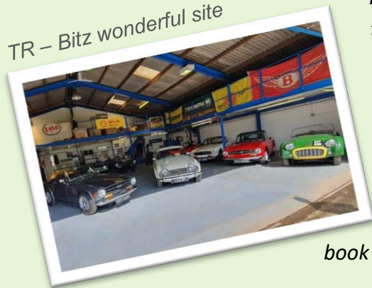
TR – Bitz wonderful site