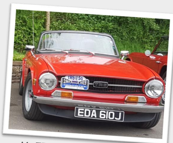
My TR6 (Celebrating 50 years!!)