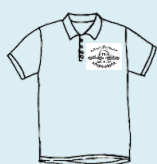
Polo Shirt £15.00