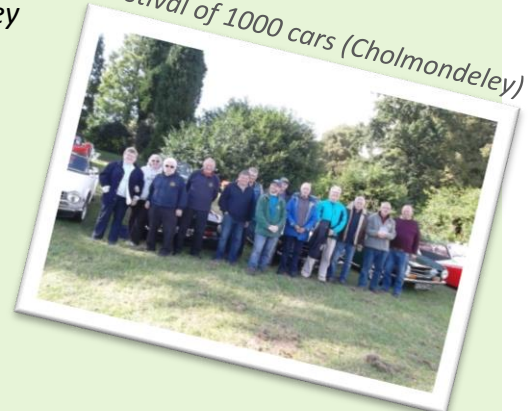
Festival of 1000 cars (Cholmondeley)

September saw the Group attend the Cholmondeley Festival of 1000 Classics at the wonderful Cholmondeley Castle. Although the weather was damp the day was well attended by the group. We also were joined by the Shropshire group and in all some 25 cars attended. The day saw the Club stand get best display and the group received a rather nice glass plaque.