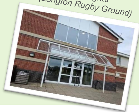
Club Nights (Longton Rugby Ground)

November club night had a great turn out of 15 members, even though it was moved from our usual first Monday of the month to the second Monday of the month. The group caught up on the previous month's outings had a couple of drinks and a large plate of chips we made plans for future 2020 events, and also had our monthly club raffle which supports the clubs ongoing commitments.