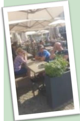
3 nights in Vannes

We spent 3 nights in Vannes a wonderful pretty coastal town with stepped in history. We also made a couple of excursions from here to the standing stones at Carnac followed by ice cream on the harbour at La Trinite-sur-Mer. The following day we visited the medieval walled town of Guerande which was lovely with some nice shops. The journey