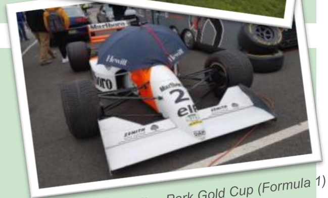
Oulton Park Gold Cup (Formula 1)

Late September the group met up for a leisurely drive around the glorious Peak district taking in some of the fantastic scenery. The group met at the Leek Hollybush Inn, Denford, some 14 vehicles attended including a TR7. Chris gave excellent historic advice, on the various stops along the way. The weather held off and although a little cold at the start the day it stayed dry and gave us all the best views and epic drives through the Staffordshire and Cheshire countryside. The end of the day saw us attend the infamous Knight's Table travellers rest near Buxton, for a very well deserved Sunday roast and hearty dessert.