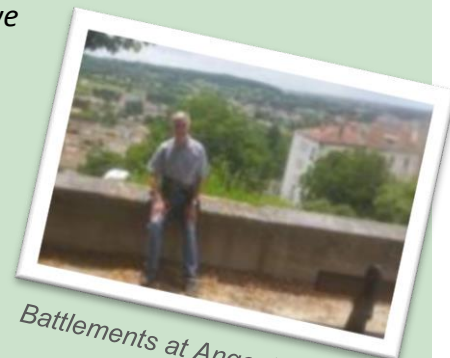
Battlements at Angouleme

soldiered on for quite a while but finally put our hoods up and it stopped quickly afterwards. We had a nice evening meal at the Le Feu de Bois restaurant next to the hotel but managed to underpay the bill by 20 euros somehow! The following day Ray and Anne hit Angouleme town and Grafton and Steve visited the very moving ghost town of Oradour-sur-Glane where 642 men, women and children were massacred by German Waffen SS on 10 th June 1944. We too later looked around Angouleme including the battlements where they run classic car events – they looked very rough so we didn't try it out with the TR's! This time at