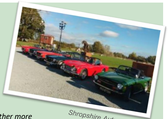
Shropshire Autumn drive

After abstaining from the Alderford Lake meet because of the rain a small group of decided to meet up a week later when it was dry & sunny. After the usual hearty breakfast at the Midway Truck stop it turned out the group had three cars from Stoke, two from Shropshire & 1 from Redrose who had driven over from Altrincham. The group then set off on a B-road meander to the British Ironworks near Oswestry. After a couple of hours enjoying the arts & crafts they have there & a mighty fine coffee & carrot cake, the group set off home at a rather more brisk pace on the A-roads via Whittington & Ellesmere. ✉ Mark Stubbs