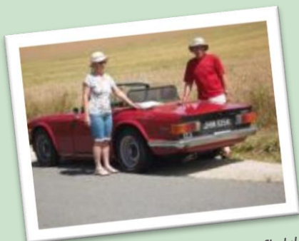
Another Corn field

The following day the 17 th we set out for Bergerac again by the pretty routes and occasionally lost, Steve had a retail disaster at the Leclerc Supermarket checked but survived for another day, Grafton managed to pack in another McDonalds and we also had an excellent evening meal at the Kyriad hotel. The next day we headed to the hills stopping for the usual coffee in the very old village of Issigeac. We then continued for more coffee in Limeuil on the