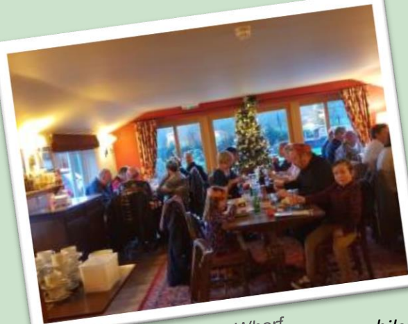
Christmas meal at the Wharf

TR Stoke Club Christmas meal, held at the Wharf Shropshire. Festive recap on the year gone by, plenty of fun, excellent food and quality banter.