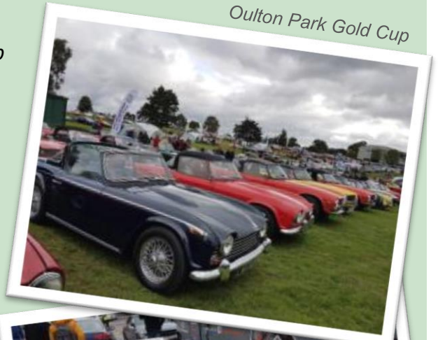
Oulton Park Gold Cup

August the group attended the spectacular Oulton Park Gold Cup weekend. The event had an excellent array of historic racing and rallying vehicles, on track there was a celebration of the 50 th anniversary of the Chevron B6/B8, Historic British Touring Cars, Formula Ford 2000, Formula 3, and even Formula 1. There was also a huge turnout of classic car clubs, displays, trade stands, live music and much more. The club was joined by the Shropshire and Red Rose clubs and in all, over the weekend some 70 TR's joined in the fun.