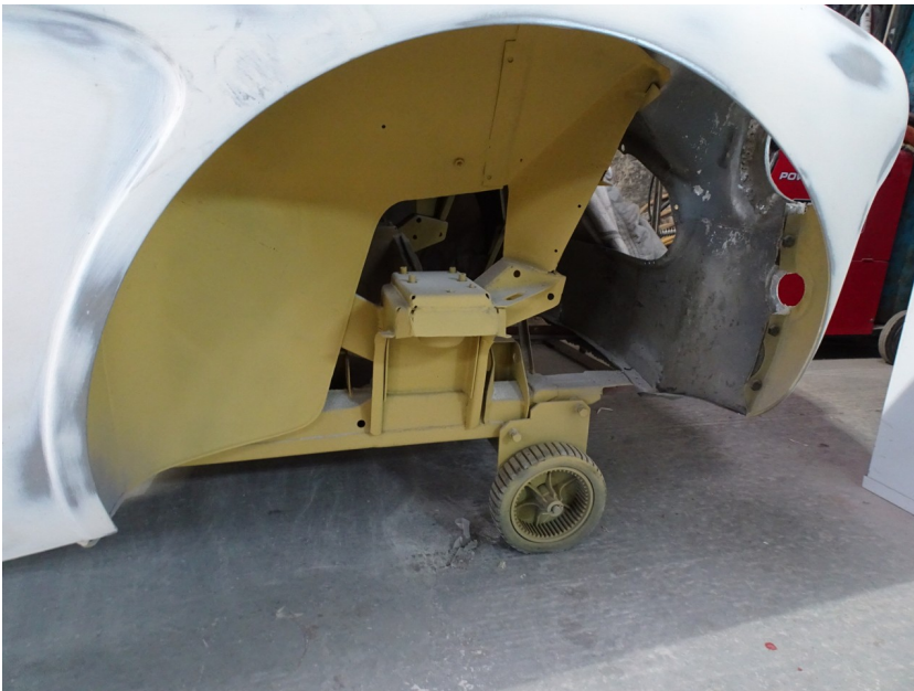
Inside the front wheel arch