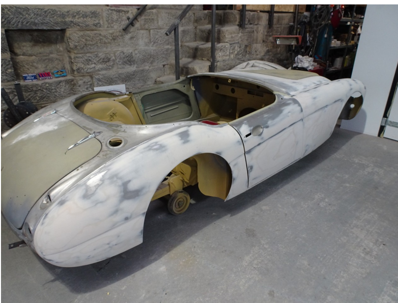
Tub in preparation for paint