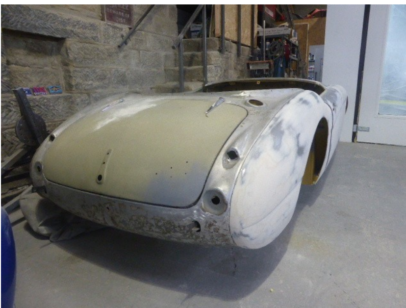
Rear three quarter view