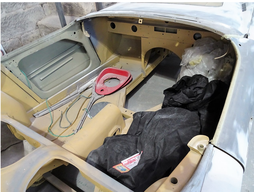
Inside the cockpit