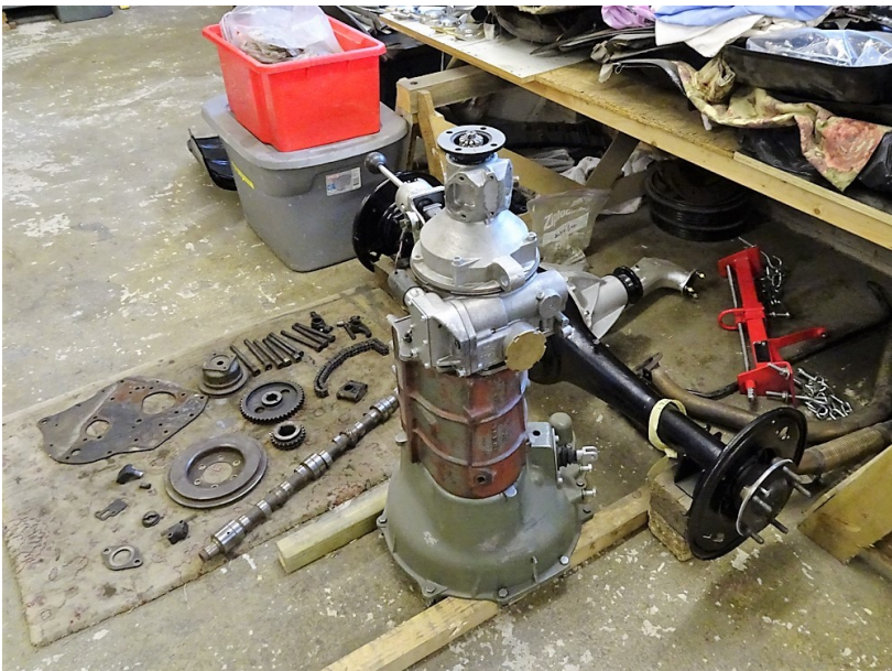
Gearbox and overdrive ready for installation