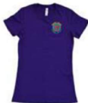
The favourite T shirt (female)