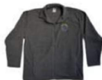
Full zip fleece