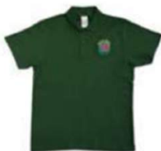
Short sleeve polo shirt