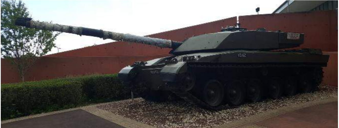
A British Army Challenger Tank stands as Gate Guard at the entrance to the museum