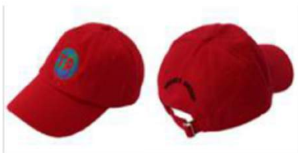
Low profile heavy cotton drill cap front and rear view

Tony Alderton is our regalia manager and he has put together a selection of items that can be purchased to promote your membership of the Wessex group. New members may wish to purchase an item or two and those of you that already have some, may need a replacement's. Shown below is the current range of items available