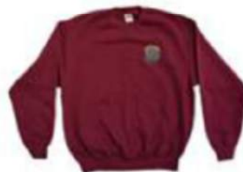
Sweatshirt Classic 80/20