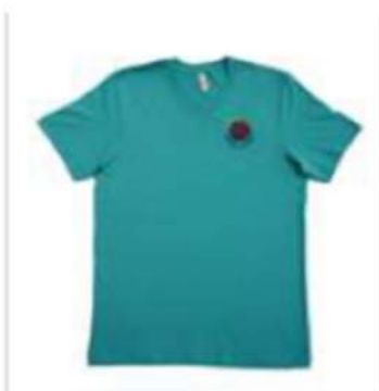
Jersey crew neck T shirt (male)