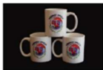
The Club Mug