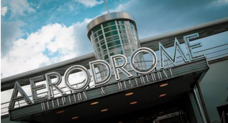
Held at the Aviator Hotel