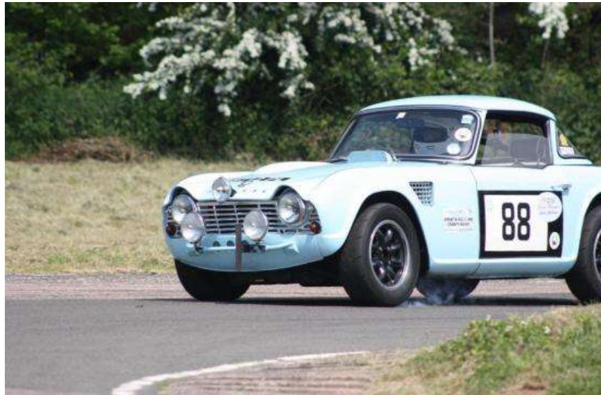
“Hooligan” Bob Barnard locking up the inside front