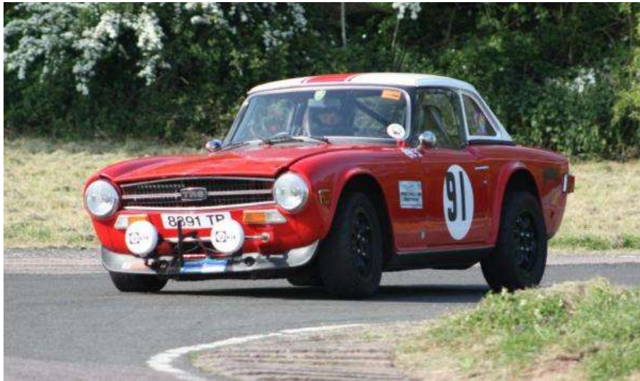
Clive Letherby approaching.... .....and exiting on three wheels...