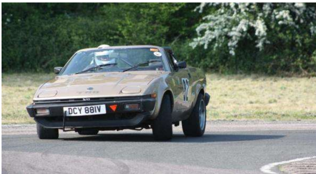
Jim Giddings coming in late, but so what with all that rubber on the track!