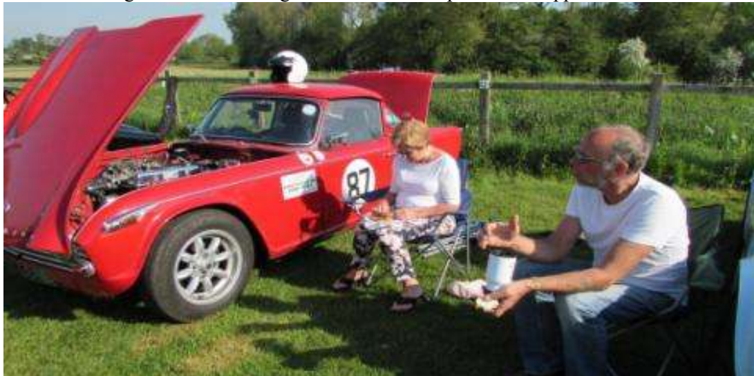
.....or has the sandwich caught her attention....?!