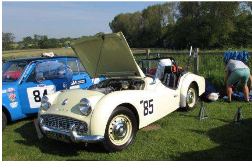
Kev Bryant and Ian Prout's dual driven TR3A.

I've used this picture, as the off side was wiped out in a previous incident and is now multi-coloured!