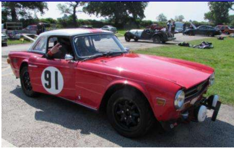
Clive Letherby's 4.0 ltr TR6