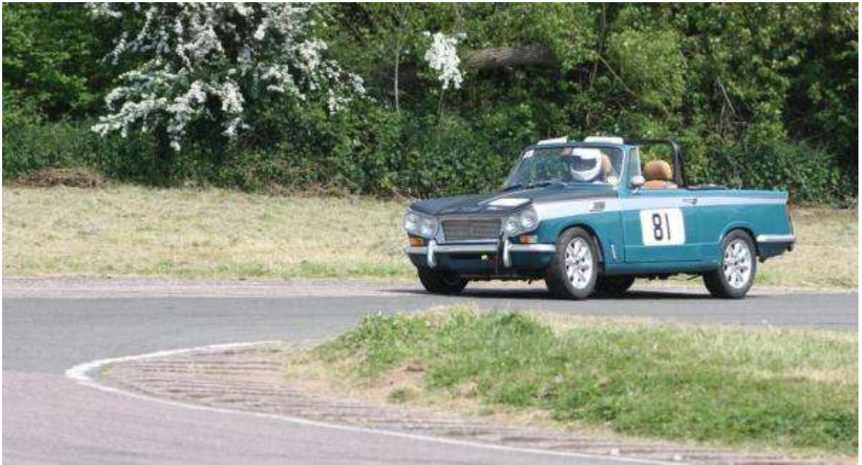
Alan Yeo getting set up for the corner