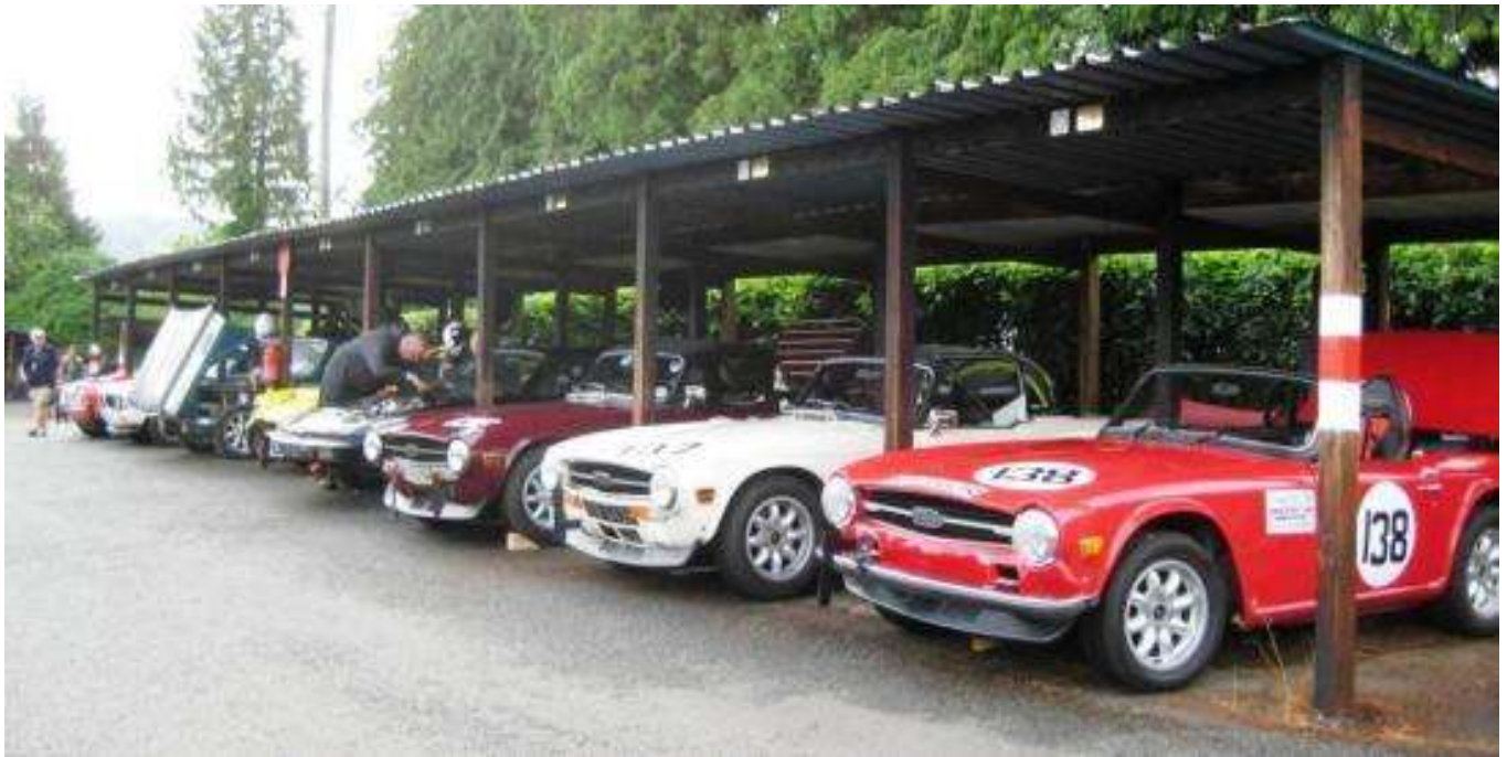
The TR's in number order....