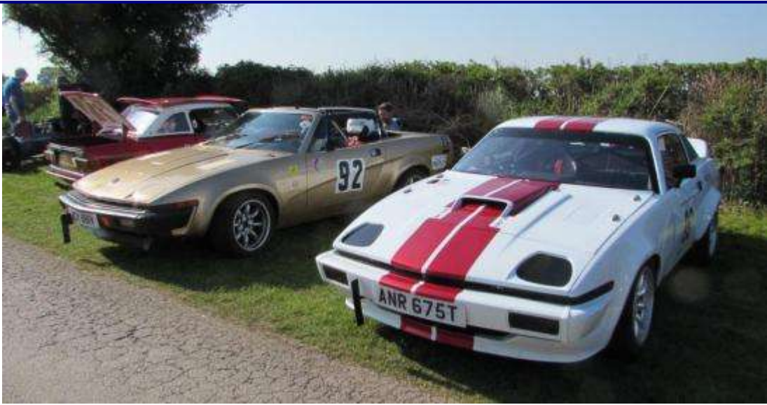
Clive Letherby's 4.0 ltr V8 TR6....with unusual aerodynamic roof panel and rear down force braking assistance.....