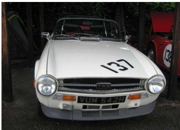
Dale Strachan's TR6 and Hot Shoe Nick Smith's TR6 - All Nick's times were under 40 seconds