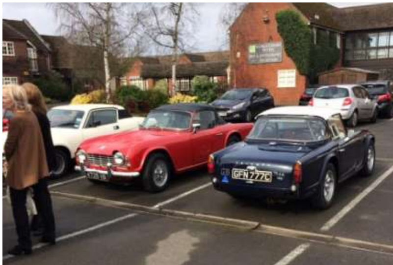
Gathering of the clans