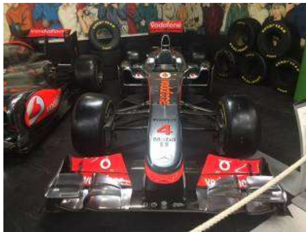
Hamilton's 2011 McLaren

The museum continues to feature many F1 cars from the early days right up until 2011 McLaren in which Hamilton won the Brazilian Grand Prix