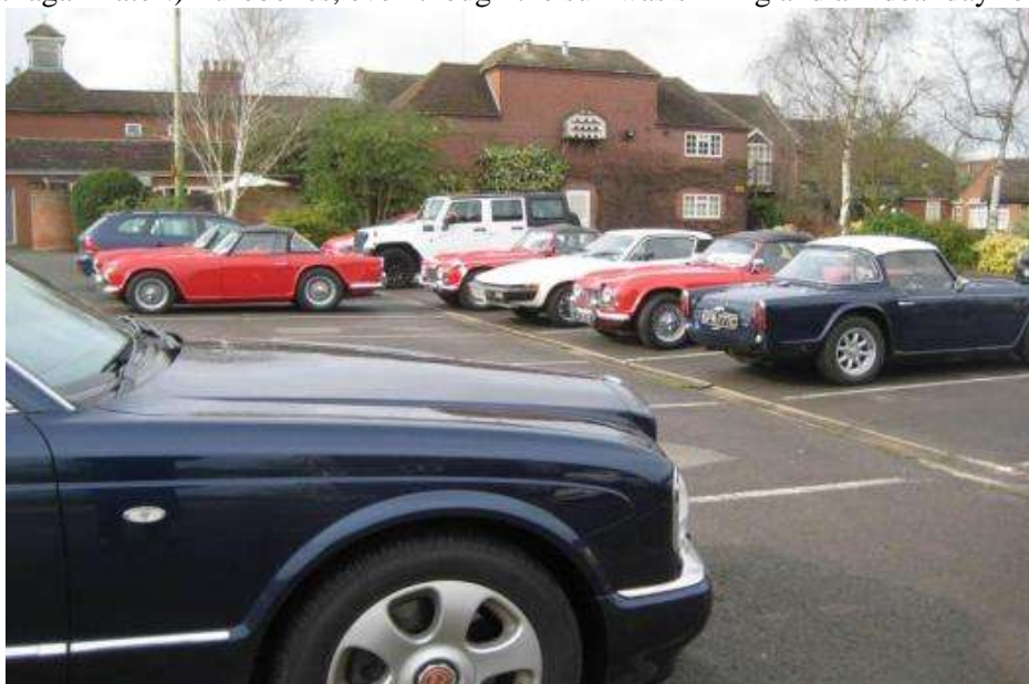
The bar was attended, and the company assembled in the dining room.....

Twenty-eight CVTR members arrived in only six TRs and a Bentley, together with an assortment of anonymous (I like that word, so it will appear again later!) Euroboxes, even though the sun was shining and an ideal day for getting the TRs out!!