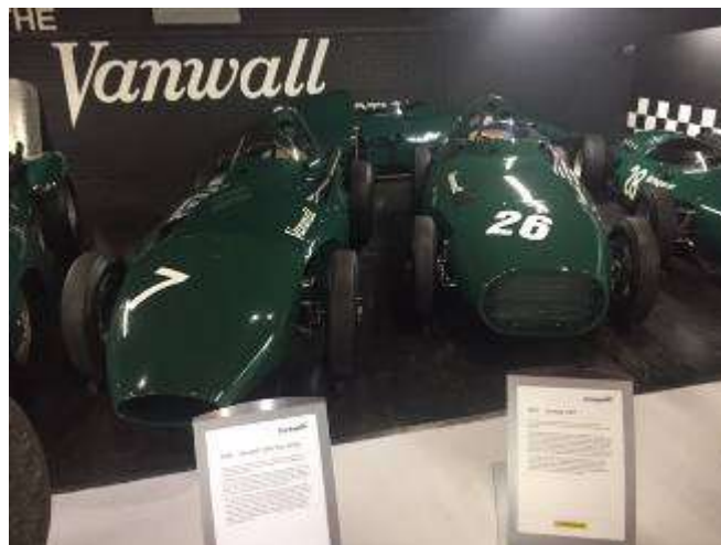
The 1958 Vanwall "Tear Drop" cars which Sterling Moss drove in the Monaco Grand prix where he missed winning the Championship by one point (Mike Hawthorn won)