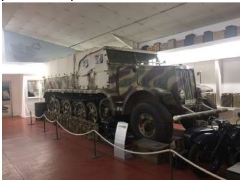
German APC with tracks capable of 5mpg on a good day but does not get stuck in the mud!