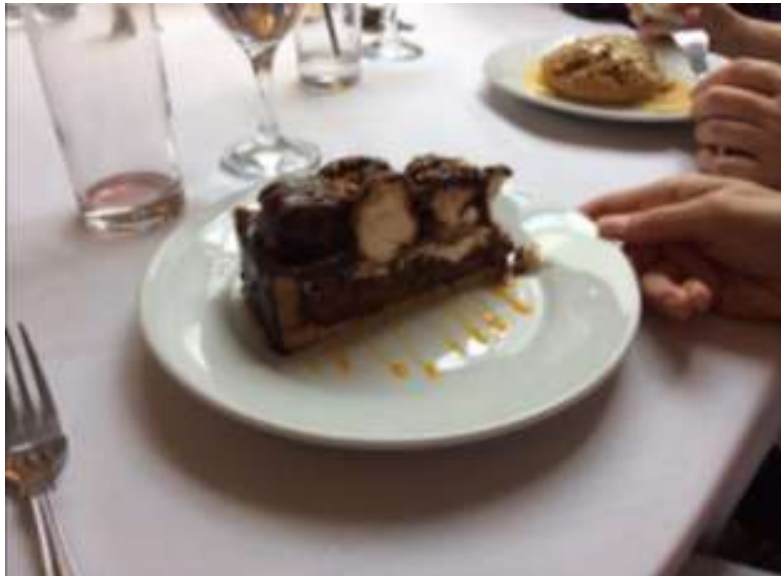
No prizes for guessing whose dessert this was !

March 12th and our first Sunday lunch of the year at The Kings Court Hotel near Alcester organised by yours truly. 28 members sat down to an excellent lunch in a private room. About 8 TRs in the car park, some of us chickened out as the forecast was rain. But being typical English weather, it didn't !!!!!!!!!!!!!!!!!!!!!