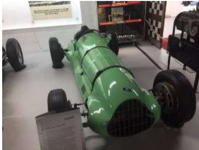
A 1945 ERA which promised much but failed to win any major titles