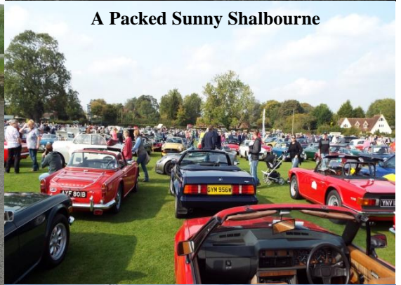
A Packed Sunny Shalbourne