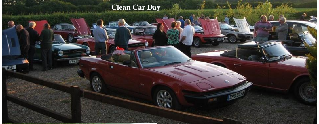
Clean Car Day

Our February meeting on the 3rd will be at the Holiday Inn West Padworth Lane Bath Road Reading RG7 5HT.