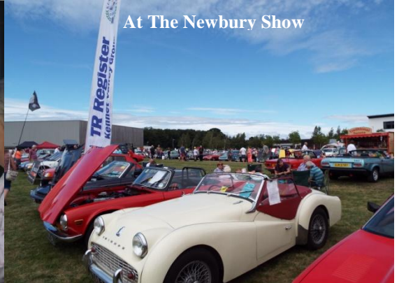
At The Newbury Show