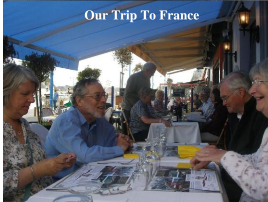
Our Trip To France