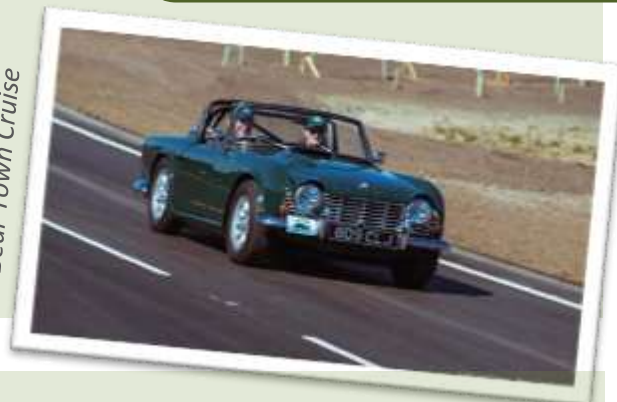
Bear Town Cruise

Congleton New Bypass opens, with a charity event organised by the Bear Town Road Cruise. The event raised over £1800 for Christie NHS Trust, seeing a range of classic cars and commercial vehicles ride the tarmac before it had been officially opened to the public. A couple of TR member got their TR's out to join in the glorious spring day's event.