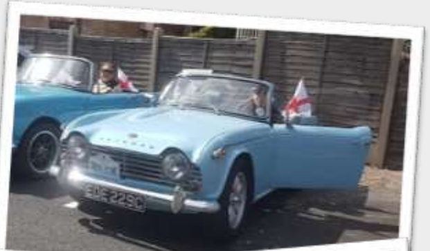
TR4a Back on the road

It all started with wanting a TR6 and visiting TRGB to view a couple of cars. Parked in the corner was an unfinished Wedgewood Blue TR4a, the body was just placed on the rolling chassis, engine bored but still in bits, no interior or hood but an immaculate body and new chassis.