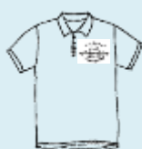
Polo Shirt £15.00