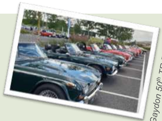
Gaydon 50 th TR Register

Gaydon 50 th Anniversary event, saw a few members venture the drive down to the Gaydon Motor museum to witness a 50 th celebration of the TR register. The event saw over 150 TRs which included TS2 and TR2 'Jabbeke' (A resident at the museum) among a vast array of BMC vehicles, the day had great weather and offer 'Free' access to the wonderful museum. (I highly recommend any petrol head to visit the museum.)