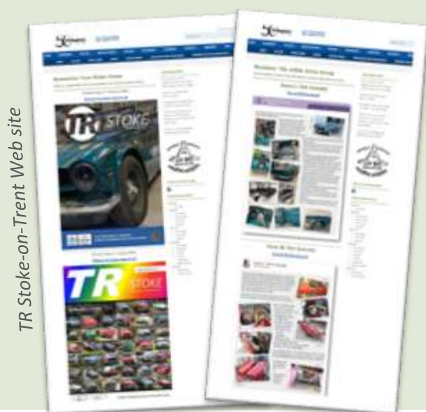
TR Stoke-on-Trent Web site

Our TR Stoke page has had a little facelift, with some photos being added and a couple of new 'tabs' added at the top of the site (Newsletters from Stoke Group & Members TR within Stoke Group). I have added these Newsletters to the site, and member's activity, so you can go and read through them at anytime you want to, and to preserve the history of the Group activities. Its quite amazing reading through the Newsletters, as to what the group has achieved and also the amount of vehicles the group has managed to preserve and get back onto the road. To get to the site search google for TR Stoke-on-Trent or use this Url link: https://www.tr-register.co.uk/group/stoke-on-trent