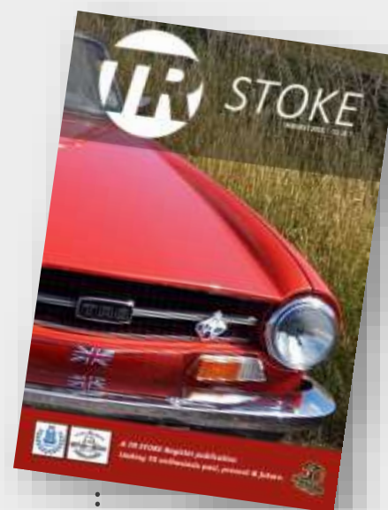
..... Front cover image: Will Loomes Gorgeous TR6